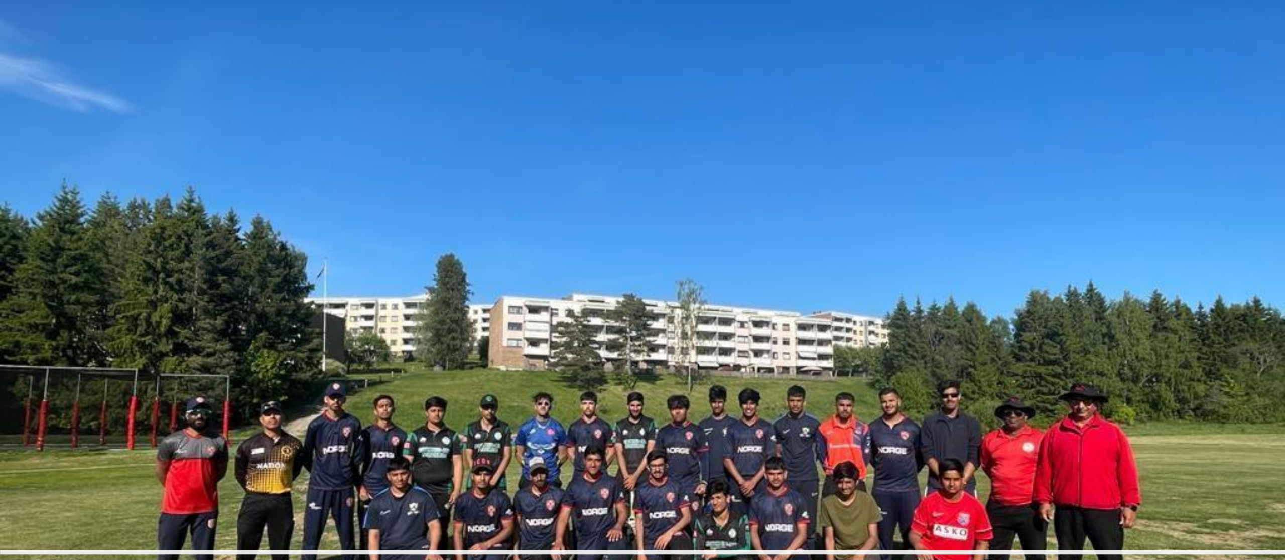
ICC U19 Men's Cricket World Cup Europe Qualifier